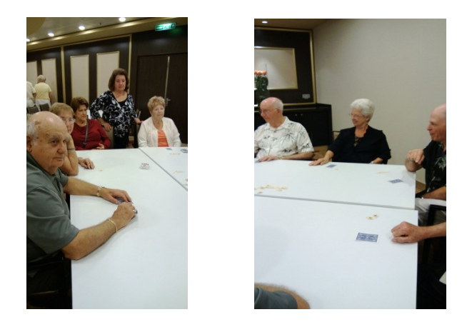
Sharp card players in the card game tournament