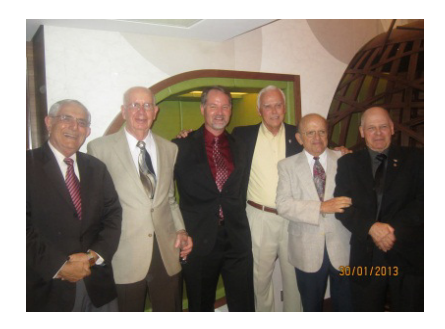
Columbiettes, Knights & friends on a Formal night