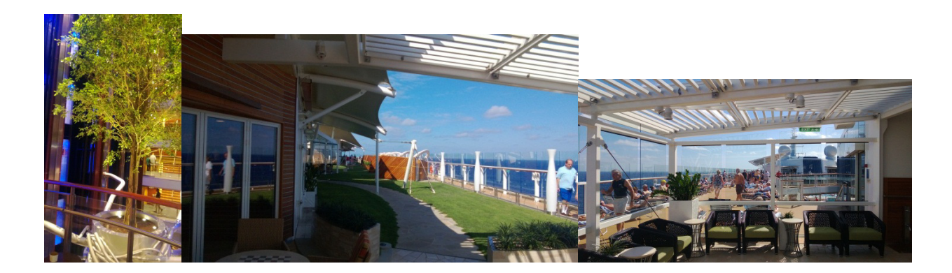
Left: A real tree grows suspended in the Centrum. Center/right upper deck scenes.